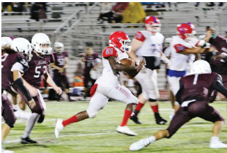
#21 runs against NE