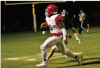
#5 QB runs to daylight