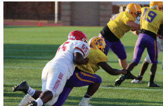
#7 tackle for loss