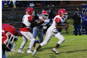
#22 getting the handoff